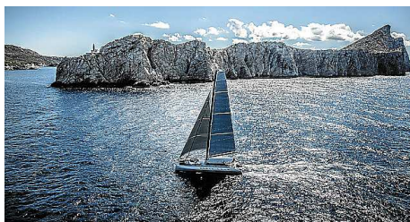
Allegra 4th.