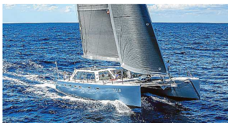
Slim 3rd.