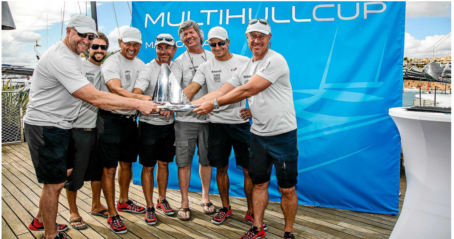
R-Six winners.