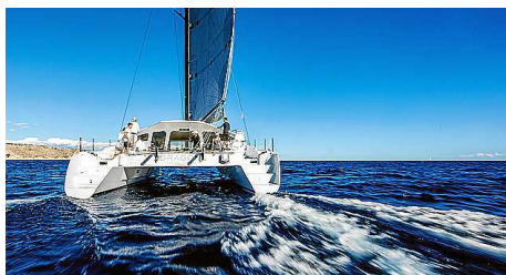
Dragon 5th.