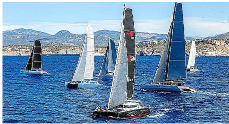
All the entries first day.