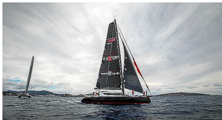
R-Six winners.